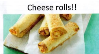
Frozen Cheese Rolls, ready to heat and eat! $5 for pack of six

Support the Motueka High School Athletics Academy