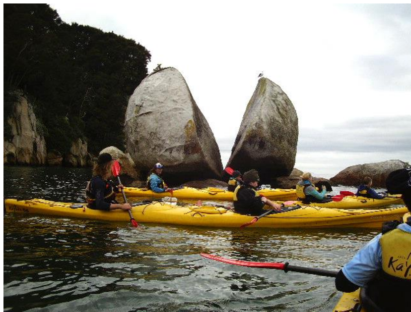
Room 5 kayak around Split Apple Rock.