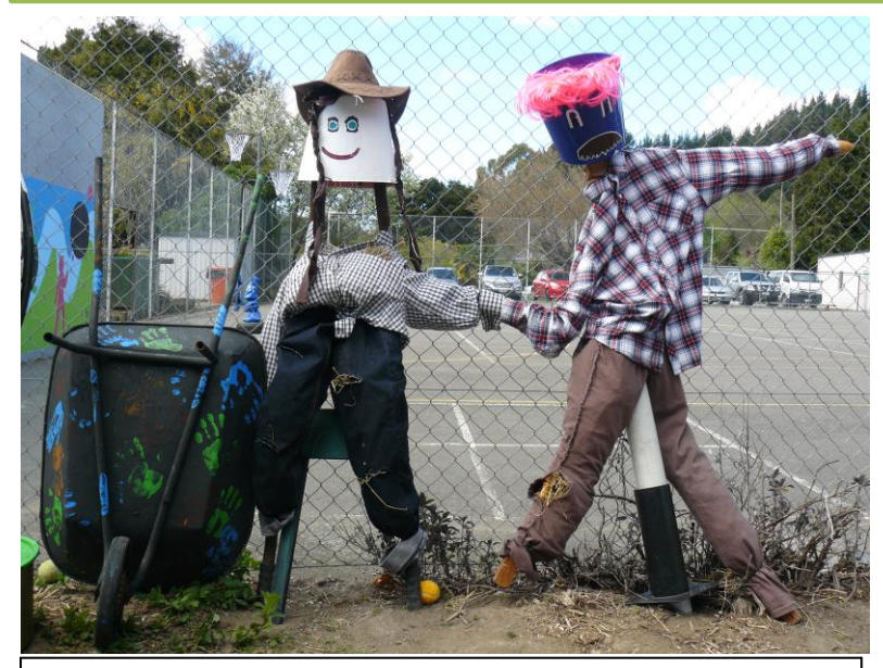
Here are a couple of characters our students have been making to advertise this year's Festival. Please make and display your own scarecrow over the holidays! ©

WANTED! House & Garden magazines to make seed packets for festival plant stall. Also old CDs/DVDs for art project. Please send to the Indigo Room. Thank you.