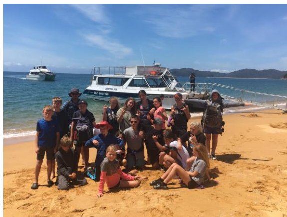
Waiting for our boat to take us back to Kaiteriteri

Last week we went to Totaranui for our end of year camp. We all got to go biscuiting, fishing, kayaking, tramping, swimming and much more. We all stayed up late and were exhausted by the end of each day. The weather wasn't perfect, but it was still heaps of fun! Thanks to all the parents who helped us make this possible. We couldn't have done it without your help. By Pipiri and Jacob