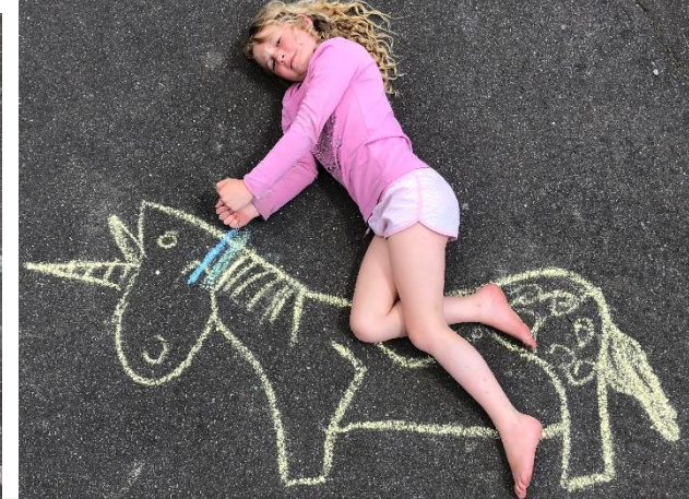
Book Week Photo Competition: Stella is fish food and Lacie rides her unicorn! ©