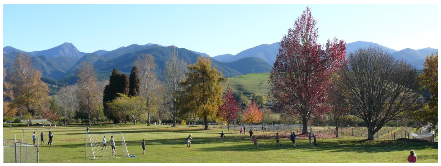
It is wonderful to see children learning and playing together in our beautiful school grounds once again!

Farewell Elvie! We are sorry to have to say goodbye to Elvie who has moved to Nelson. Good luck and be happy at your new school Elvie!