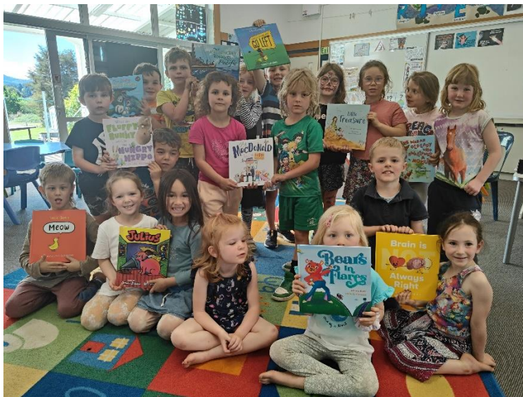
Room 1 students are loving a new set of picture books we have bought for the library! Little angels!

Our swimming pool will be opening next Wednesday. Ian has been busy cleaning and preparing it, and after a water test it should be ready to go by Wednesday for optional lunchtime swims only at this stage . Pool keys for the season will become available for sale following next week's board meeting.