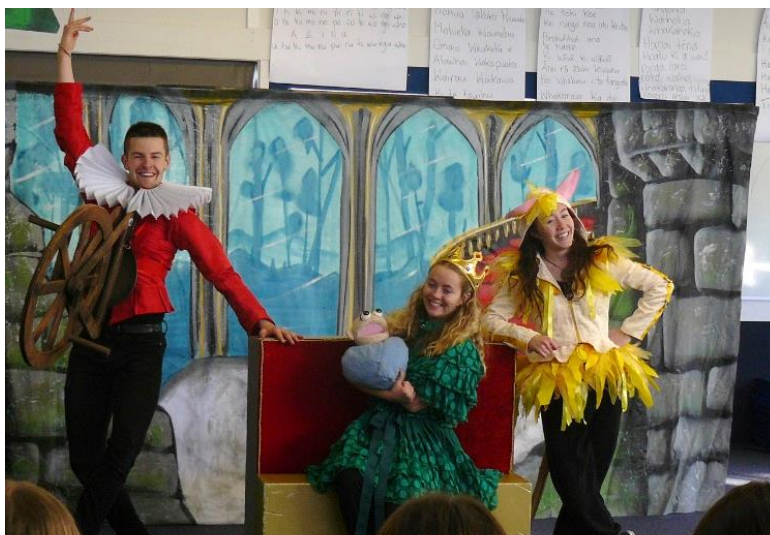
NZ Playhouse delighted our students with their version of Rumpelstiltskin last week, thanks to Festival profits!