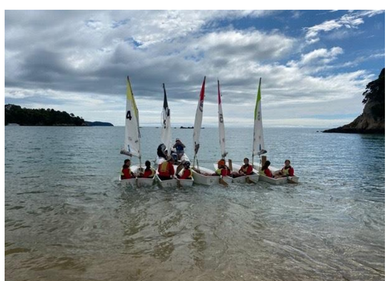
Room 5 students have been lucky to enjoy a couple of days of fantastic sailing experience at Kaiteriteri with Sail NZ. Thanks to parents for your transport and support for this special activity.

As well it keeps the school van running, enables us to save for new swimming pool changing rooms, helps us to maintain technology, and it ensures nobody goes without when it comes to school activities.