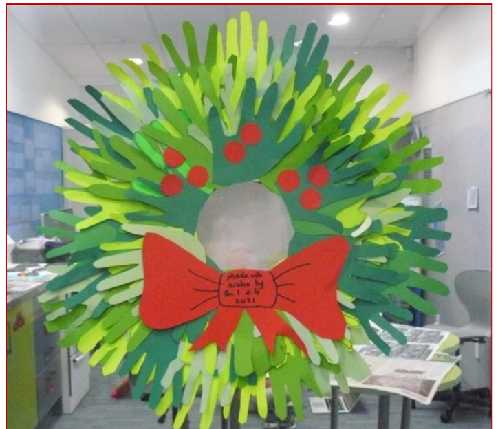
Room 1 & 4 students worked together to make this beautiful Christmas wreath. Meri Kirihimete!