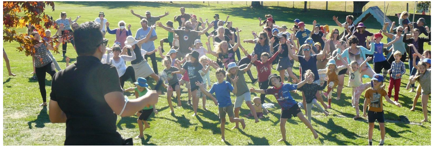
It was so wonderful to see all our parents and students dancing together at the end of last term! Thank you all for coming along to support our students, we love that we are able to bring our community back together once again.

<u>Swimming Pool Keys</u> The pool is now closed. Please return your pool keys to the school office to receive your $10 refund. Thanks all!