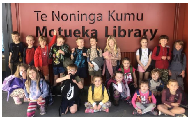
Room 3 students enjoyed a day out at Motueka library this week. Room 4 will visit next Monday.