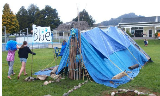
Blue house's creation as a part of the house hut building challenge