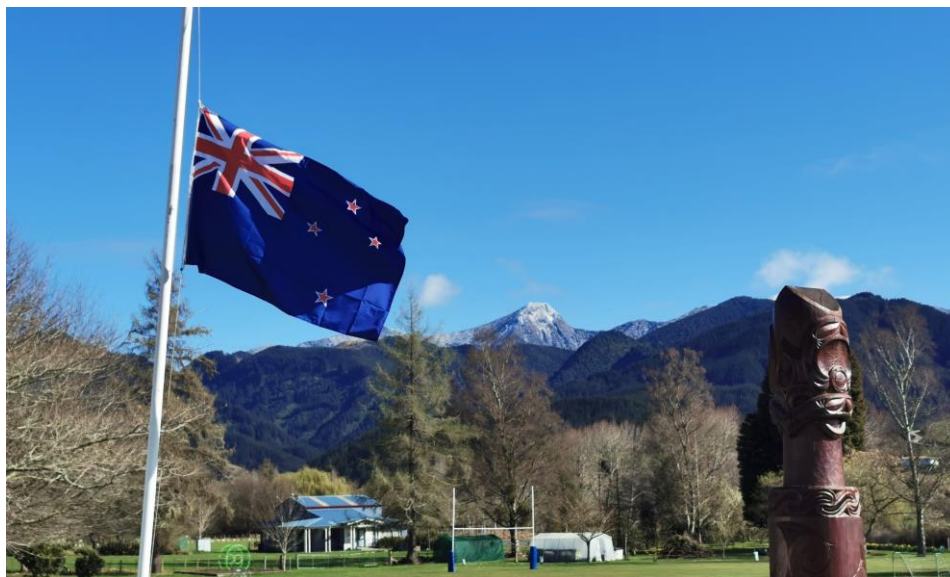
To mark the passing of Queen Elizabeth II we have our flag flying at half-mast. The Government has announced a Memorial Holiday for Monday 26 September.