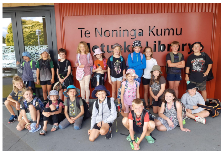
Room 4 students at the Motueka Library this week.