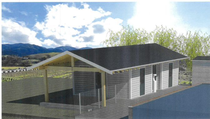
The planned new swimming pool changing shed with a toilet on each side. The existing old shed will remain and be used for storage.

Good things take time! A few years ago a suggestion came from a Parent Group meeting that it would be good to have a toilet at the swimming pool. From this, the Board has done a lot of work getting thoughts from students, quotes from builders, Ministry permission and iwi consent. We have had plans drawn up and have now got TDC and iwi consent. This is turning out to all be quite expensive, and so although the Board tagged $100,000 of savings from previous Festival profits, we are still applying for more funding. This is taking some time! Good things are worth waiting for, and so this message is just to keep you in the loop that this project is still alive!