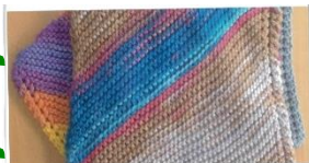
DISH CLOTHS, 100% COTTON MADE IN MOTUEKA

Collect from School - cash or online 01-0666-0296039-00 Andrea Blackburn